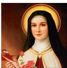
St. Theresa of the Child Jesus Feast: October 1

St. Theresa of the Child Jesus, often called the Little Flower, was born in Normandy, France, in 1873. She used to say after my death, I will let fall a shower of roses. I will spend my heaven doing good on earth." The Little Flower died on September 30, 1897. She was proclaimed a saint by Pope Pius XI in 1925. She also proclaimed as Universal Patron of the Missions, and Doctor of the Universal Church. Reflection: "O Jesus, my love, my vocation, at last I have found it. My vocation is LOVE!"