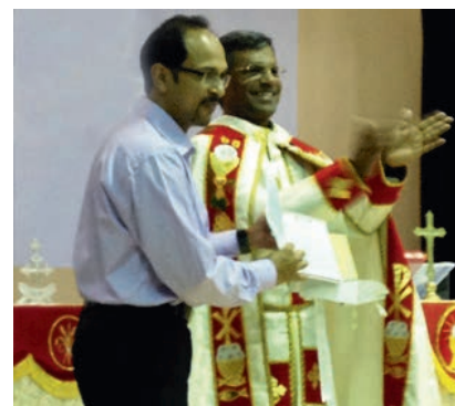
Catechetical Calendar Inauguration