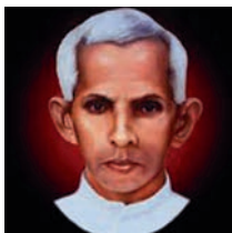
Blessed Kunjachan Feast: October 16

Born at Avila, Spain, 28 March, 1515; St. Teresa died at Alba de Tormes, 4 Oct., 1582. In her self, in her prayer, in her life, in her efforts to reform, in all the people she touched, she was a woman for others, a woman who inspired and gave life. Her writings, especially the Way of Perfection and The Interior Castle, have helped generations of believers. In 1970, the Church gave her the title she had long held in the popular mind: Doctor of the Church.