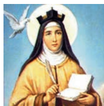
St. Teresa of Avila Feast: October 15

St. Francis Assisi, Founder of the Franciscan Order, born at Assisi in Umbria, in 1181. He gave up all his possessions to become the servant of God. He began by praying more and making sacrifices to grow strong in spirit. As a reward for his great love, Jesus gave him his own wounds in his hands and feet. Reflection: Francis followed the example of Jesus closely by living a life of simplicity and teaching others the Gospel message with great joy.