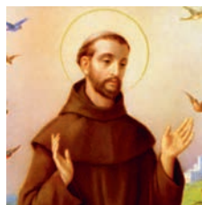
St. Francis Assisi Feast: October 4

In 1608, Pope Paul V added October 2nd as a feast of Guardian Angels to the calendar of saints and celebrations. It is very encouraging to know and believe that we each have an angel guarding and protecting us. Our guardian angel is a gift from our loving God. We can say this brief prayer as often as we would like to throughout the day: Angel of God, my guardian dear, to whom God's love entrusts me here. Ever this day be at my side, to light and guard, to rule and guide. Amen.