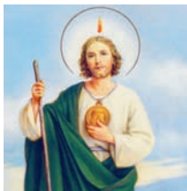
St. Jude Feast: October 28