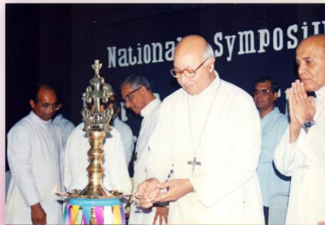
Inauguration of the symposium