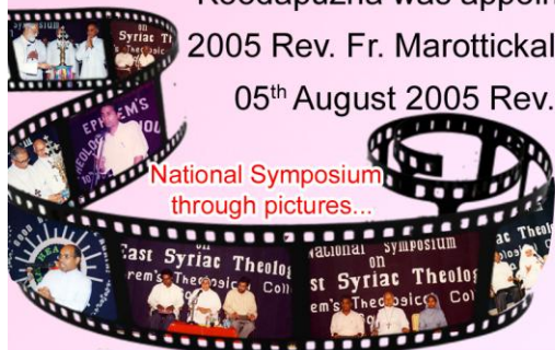
National Symposium through pictures...

St. Ephrem's Theological College P.B. No. 26 Satna - 485 001 ephremsatna@gmail.com www.ephremsatna.org Ph: 0091-8989062420