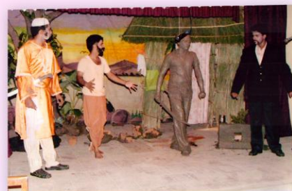
Home day Celebrations