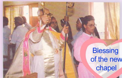
Blessing of the new chapel