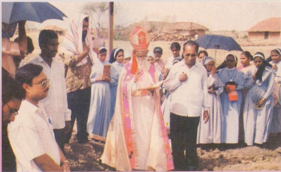
The Foundation Stone of New Building